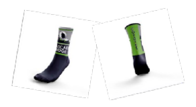
Cascade Ridge Coyotes – Get your Gear!

Order your Brown Bear Car Wash tickets today! Get a clean car, save money and earn $$$ for Cascade Ridge PTSA! For every $5 ticket purchased CRE PTSA earns $3.50 (normal price for basic exterior car wash is $8.00). PTSA Website: Now you can order your car wash tickets from the PTSA website with an option to pay via credit card or check. The tickets will be delivered to your child through their classroom, within a few days after payment is received. We have 4 packages available online: • 1 for $5 • 4 for $20 • 10 for $50 • 20 for $100 http:// cascaderidgeptsa.org/Packet/PassiveFundraising Please direct any questions to nicbrenner@yahoo.com