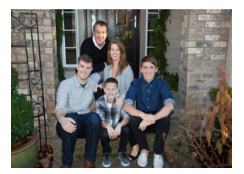
The Pugh Family